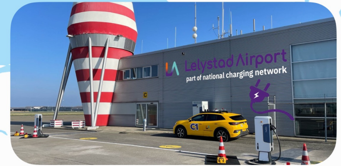
Lelystad Airport (signing = concept)